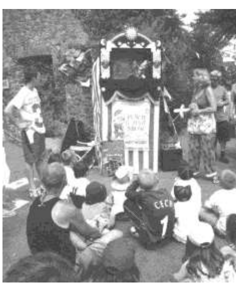
A big thank you to everyone who helped.

Next year's Fair is on Sunday 1st July. Please put it in your diary.