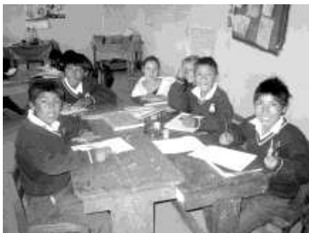
Churston students working with primary school children in Lucre Peru, producing the artwork and writing that was part of the calendar.

Calendars are on sale for £5.00 at Churston Ferrers Grammar School , White Rock , and Collaton Primaries and at Eric Lloyd & Co estate agents, one of the sponsors. Contact the school on 842289 for details.