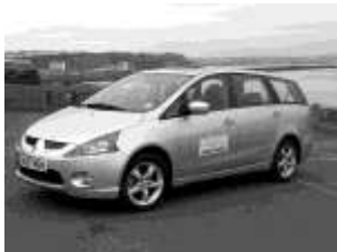
6 seat people carriers