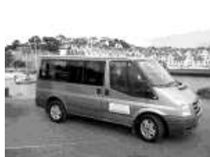
8 & 16 seat minibuses