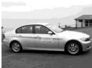
4 seat BMW cars

Please call for people carrier and minibus prices.