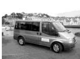
8 & 16 seat minibuses