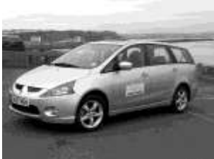
6 seat people carriers