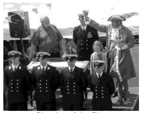
Blessing of the Pie